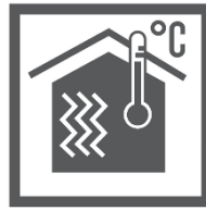
IDEAL COVER OF THE FACADE INSULATION