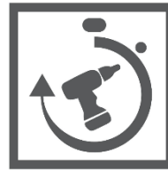
QUICK AND EASY INSTALLATION